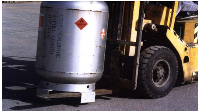
Typical A-5 Cylinder Handling