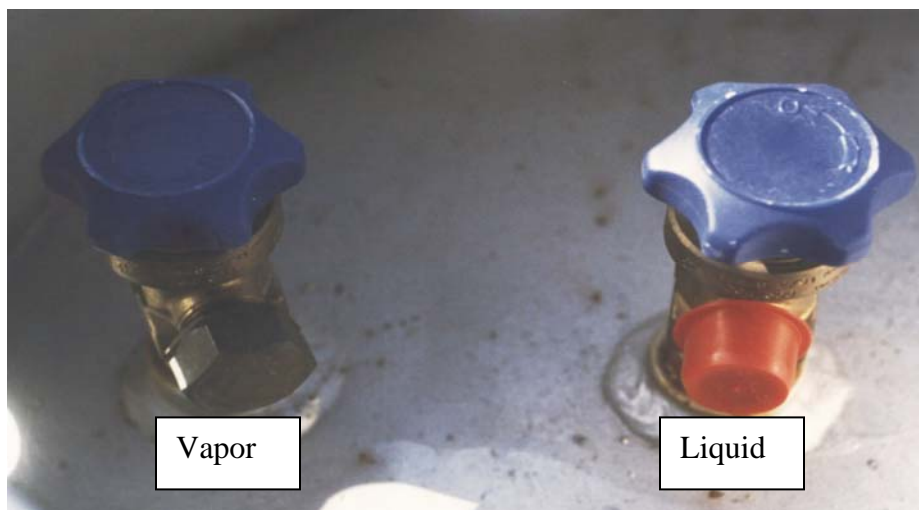
Typical Valve Configuration (A-1, A-5 Cylinders)